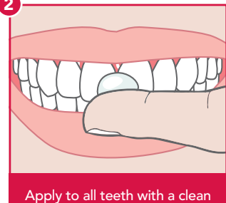
finger and use your tongue to spread around evenly.